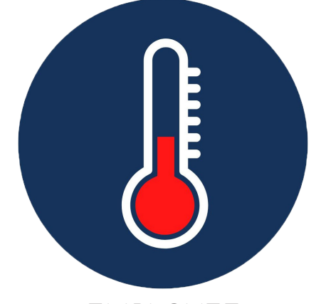
EMPLOYEE HEALTH SCREENINGS