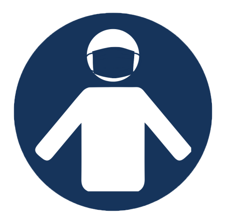
FACE COVERINGS REQUIRED FOR EMPLOYEES

Here is how our hotels & local businesses are ensuring safety for customers and staff: